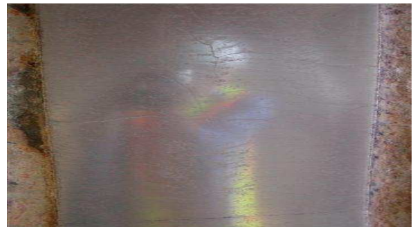
Matt Reflective Finish on ARCOPLATE