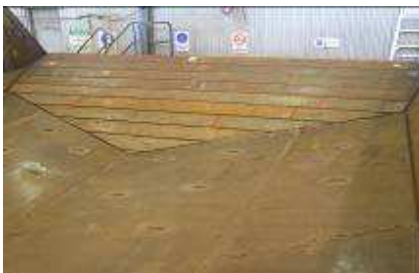
Cat 793 @ Cadia Hill Gold NSW

Arcoplate's uniform hardness and superior microstructure allows for clear projection of wear rates so planned maintenance is achievable. Arcoplate helps to maintain structural integrity in all fixed and mobile plant. Alloy Steel International kit designs improve load discharge and eliminate hang-up material.