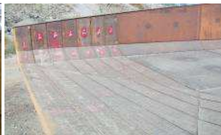
Cat 785C @ Ravenswood QLD