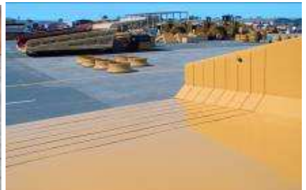
Cat 785C @ Westrac WA

With no weld beads and no under bead cracking Arcoplate is the world's most wear resistant fused alloy steel plate providing superior results in all sliding abrasion, high impact and Anti Hang-up situations